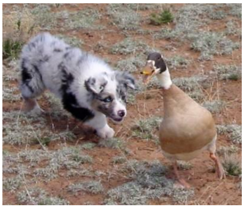
SUPERVISE WITH PATIENCE, LOVE, COMPASSION AND UNDERSTANDING.